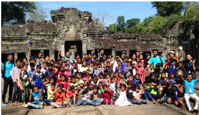
School Outing for Khmer New Year in April

The school year in Cambodia runs from November to October. In 2017 between January and October, 307 students in total attended GHCC's Basic Education program, of which 206 were full time with an average daily attendance of 79.5%. The Head Teacher and GHCC social workers collaborate to monitor students' attendance and identify needs that can be supported to enable the children to remain in both state school and GHCC education.