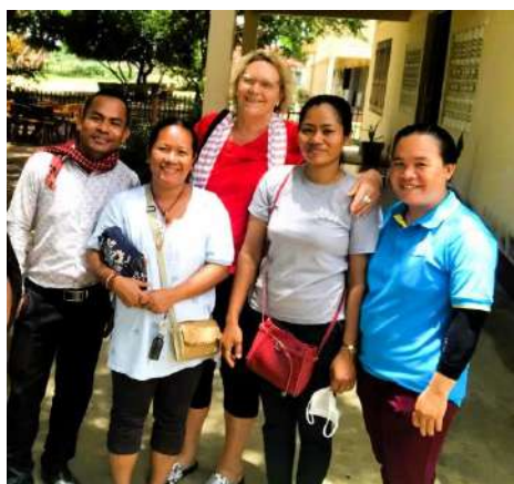
GH Staff visit Karuna Battambang

Always a highlight at Grace House is the opportunity to spend time together as a team. For many years, volunteers were included in these celebrations, but just because there have been very few volunteers in 2022, it didn't mean that the staff didn't have some fun!