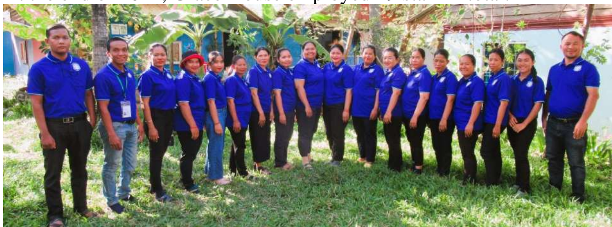
Grace House Staff

At the end of 2022, Grace House employed 19 staff in total.