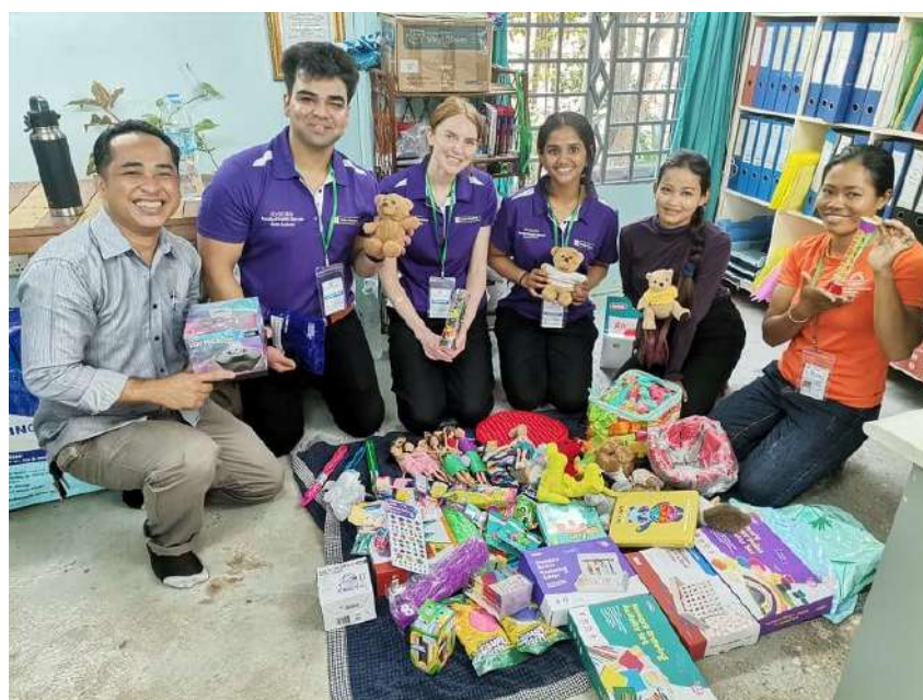
Students from Curtin University arrive with supplies for the special needs students

Students from Curtin University returned to contribute their skills (and some resources) to the special needs unit. They perfectly supplement the unit which is funded by the Danson Trust in the UK.