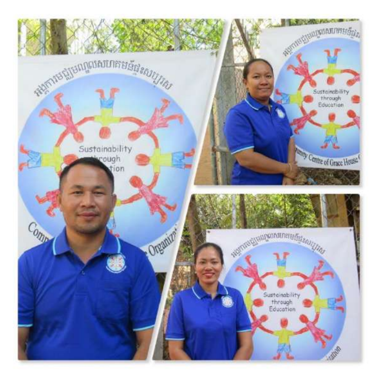
Executive Director and Committee Members