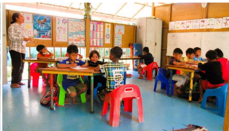
What a difference from the start to the end of 2022!

As in previous years, all students were given resources such as back packs, books and pencils and a water bottle. These are donated by volunteers, and CCGHO gives them a set of school uniforms at the beginning of each academic year.