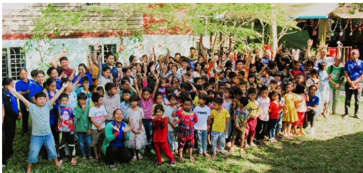
Christmas fun at Grace House