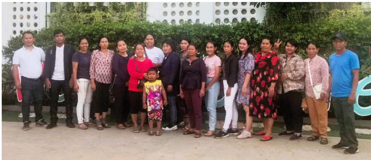
Staff Outing - Battambang

regime were executed. It was a long and full day out, but a wonderful day spent together.