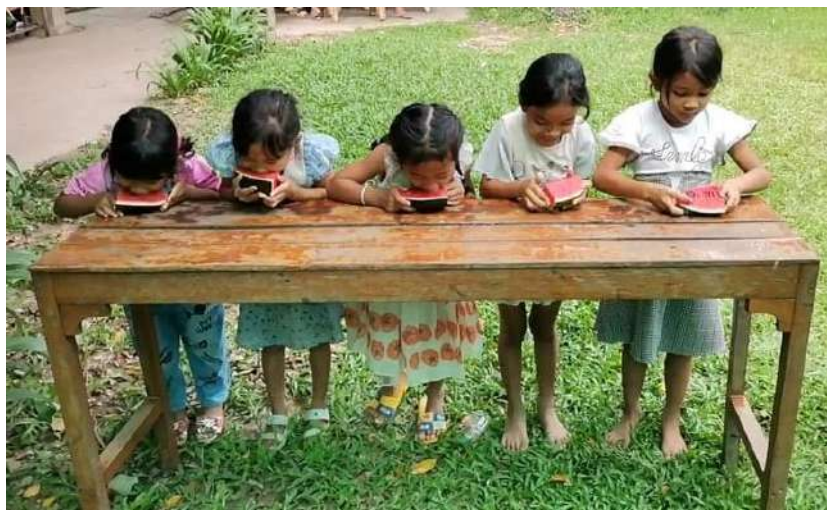
Food packages to 30 families and regular fresh fruit for students

And of course, we made sure our students received fresh fruit on a regular basis.