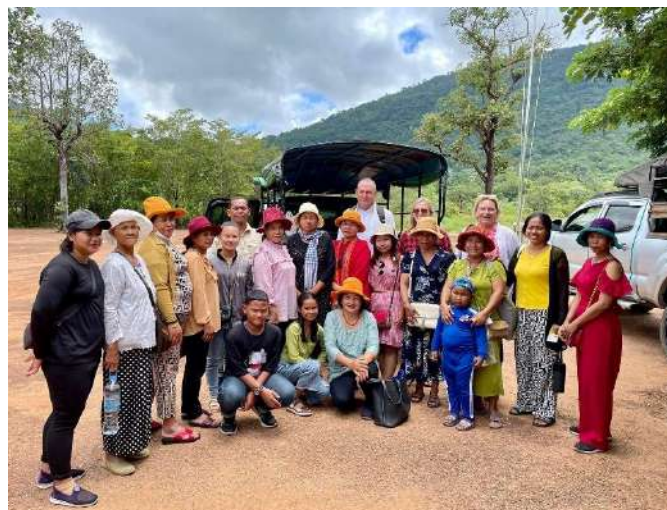
Staff Outing to Preah Vihear